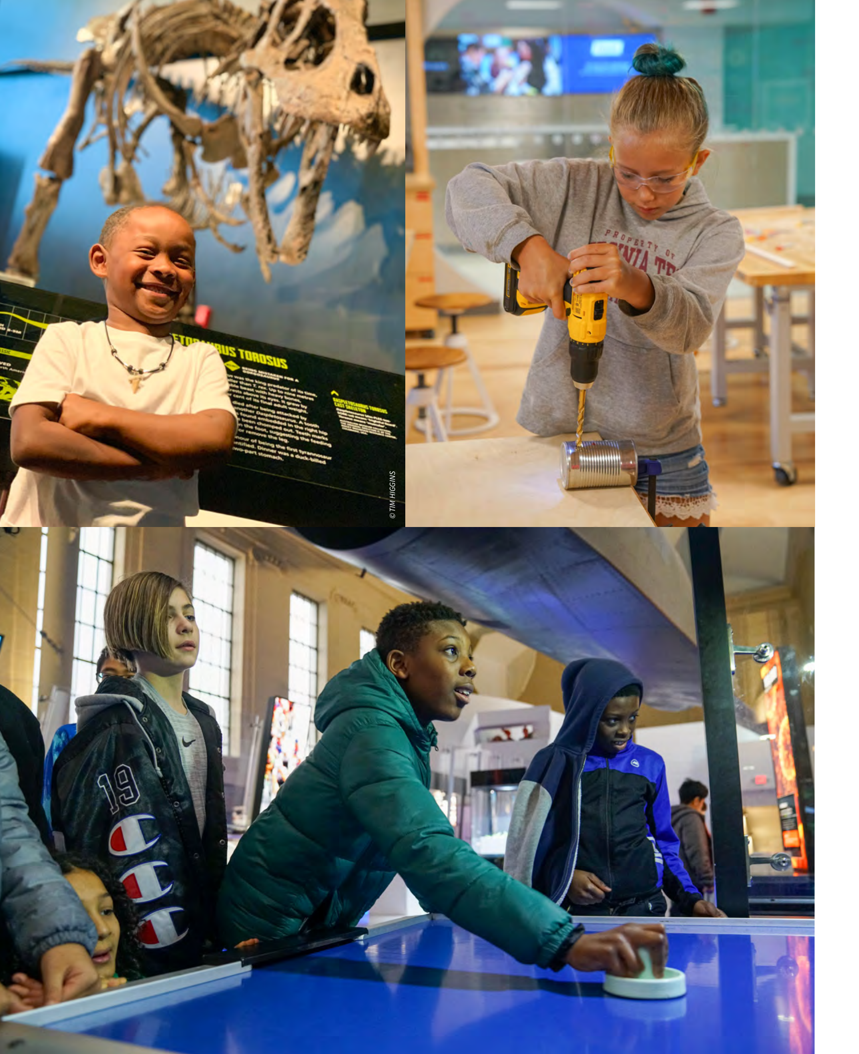
Exhibit Gallery Upgrades

To ensure the Science Museum's exhibits remain relevant and engaging for guests, the Science Museum will refresh several key experiences including an upgrade of The Dome projection system (completed between 2022 - 2024), development of a new exhibition to replace Boost (completed between 2024 - 2027), and initiation of a plan to develop a new exhibition to replace Speed (completed between 2027 - 2030). These major gallery refreshments will require fundraising to fully implement.